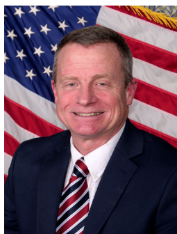
Mayor Peter Nystrom

As I am sure you are all aware, the State of Connecticut has begun the process to significantly ramp up its efforts to increase the number of individuals to be vaccinated.