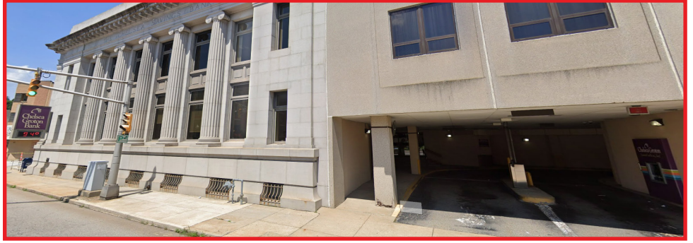
Potential location for Norwich Police Department headquarters

Further down Main Street, more apartments are being completed – and these future residents will want places to eat, shop, and spend time and