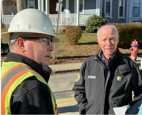
Congressman Joe Courtney visited NPU's work on Asylum Street.

In November, Norwich Public Utilities (NPU) and private contractor crews began a multi-year, $20.9 million project to replace aging and leak-prone cast iron natural gas mains with more than 9 miles of new, high-density polyethylene (HDPE) gas mains throughout the city.